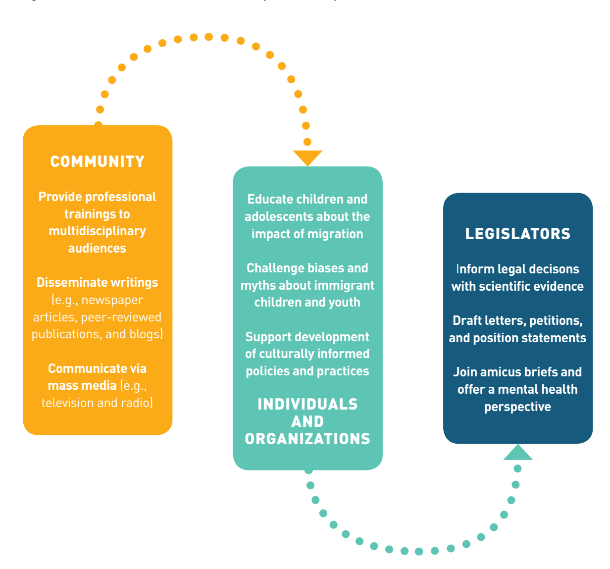
Figure 3. Education as a means of multi-level social justice advocacy.

p, 685). In particular, mental health professionals can shed light on the special needs of indigenous, ethnically diverse, and LGBTQ youth who often get lost in a "one size fits all" mentality and generic policies designed for immigrant children. Training regarding immigration remedies available for unaccompanied children is essential to access "protection from deportation and the ability to live, work, and heal under the protection of U.S. family court and immigration laws" (Fitzpatrick & Orloff, 2016, p. 685).